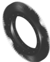
Bolt Pattern RB 16-56" Flat