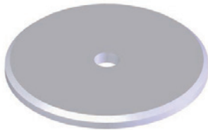
2" - 14" Standard Plates