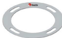
16" - 48" Sizing Rings