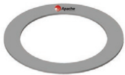
2" - 14" Sizing Rings

Apache can manufacture Pig Sizing Rings to any customer supplied dimensions, quickly and cost effectively. Sizing Rings are used to slide over a worn used pipeline pig to be used as an indication that the pig needs to be replaced by the operator. These rings should not be used as a go-no-go and only part of the operators decision making process if the used pig needs to be discarded.